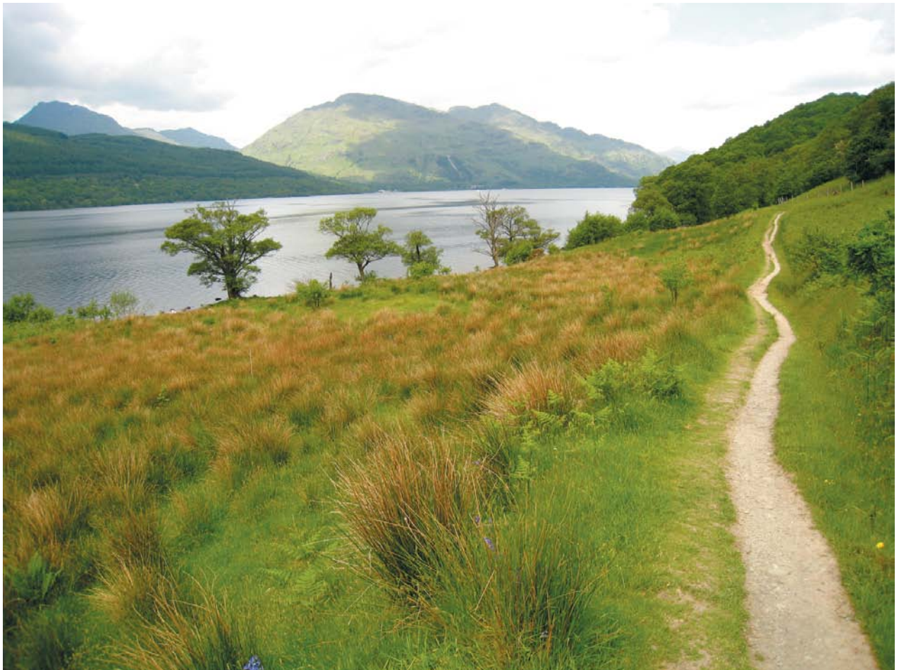
West Highland Way, Scotland

Copyright © 2011 Massachusetts Medical Society.