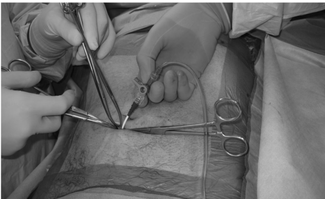
Fig. 1. Diagnostic peritoneal lavage.

Data collected included the time to perform DPL and DL and the volume of saline infused and collected with DPL. Comparisons were made between cytology results obtained with DPL (DPL-cyt) and