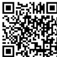
RLC website QR code. Scan with smartphone / device