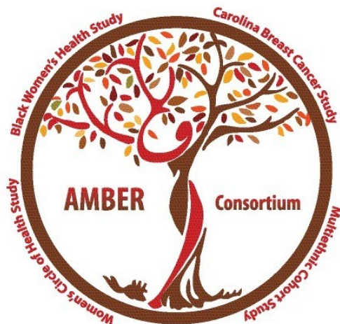
African American Breast Cancer Epidemiology and Risk

We have begun the next phase in breast cancer research with a large grant from the National Cancer Institute. Investigators from the Women's Circle of Health Study, the Carolina Breast Cancer Study, the Black Women's Health Study, and the Multiethnic Cohort Study will pool existing data, for a study of 5,500 women with breast cancer and 5,500 women without cancer representing the largest study to date on this subject. The African American Breast Cancer Epidemiology and Risk Consortium (AMBER) will combine the efforts of researchers and data from each of these four leading studies on breast cancer in the United States. During the next 5 years we will continue recruiting women in the Women's Circle of Health Study through the Rutgers Cancer Institute of New Jersey and expand the target area from seven central and northern New Jersey Counties to ten. The cases of women with breast cancer will continue to be identified through the New Jersey State Cancer Registry and the women without breast cancer will be identified through community outreach efforts by local churches and civic groups. With the