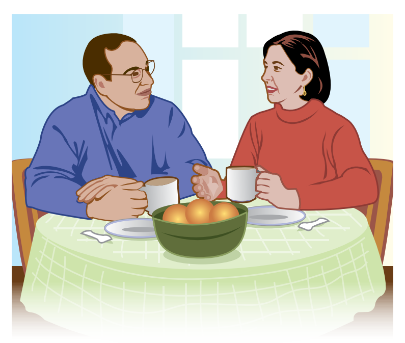
Eating well may help you feel better.

Sometimes, especially during or soon after treatment, you may not feel like eating. You may be uncomfortable or tired. You may find that foods don't taste as good as they used to. In addition, poor appetite, nausea, vomiting, mouth blisters, and other side effects of treatment can make it hard for you to eat. On the other hand, some women treated for breast cancer may have a problem with weight gain.