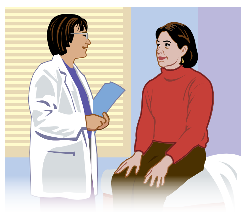
Ask your doctor how often you'll need checkups.