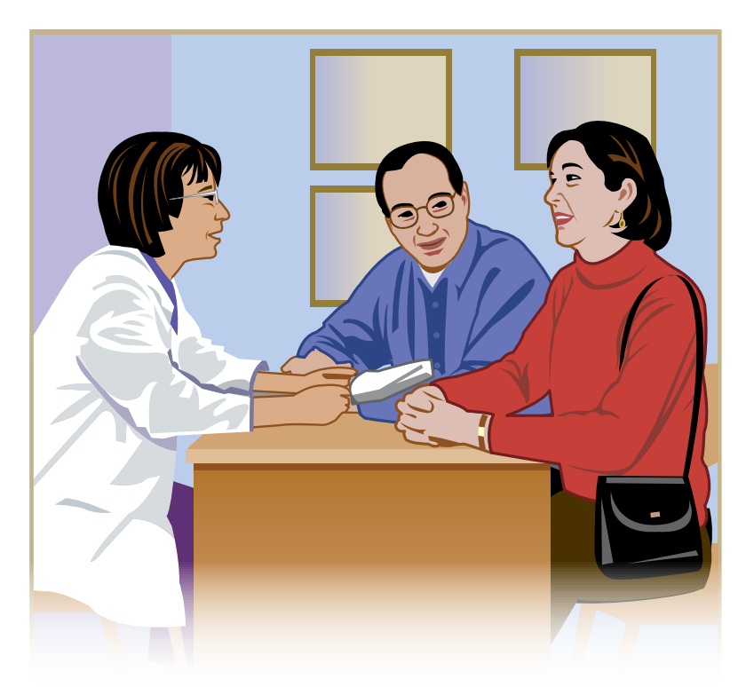
You and your doctor will develop a treatment plan.

You may receive more than one type of treatment.