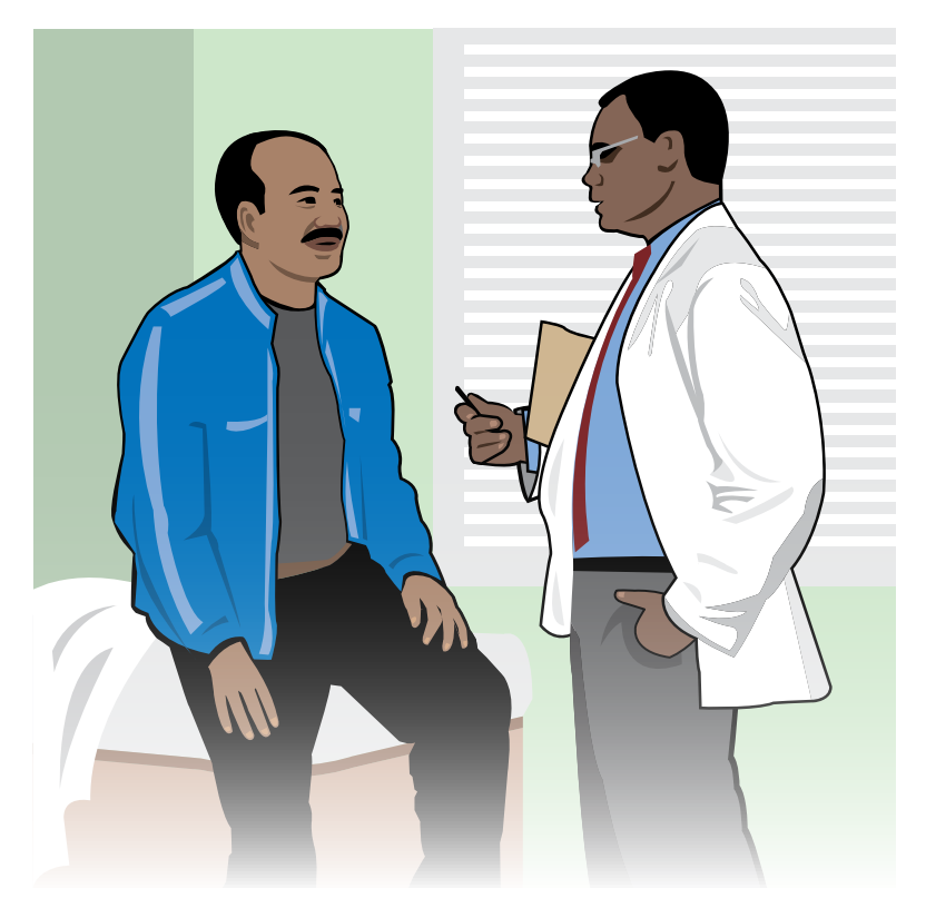
Ask your doctor whether tests show that the cancer has spread.

Doctors describe the stages of esophageal cancer using the Roman numerals I, II, III, and IV. Stage I is early-stage cancer , and Stage IV is advanced cancer that has spread to other parts of the body, such as the liver.