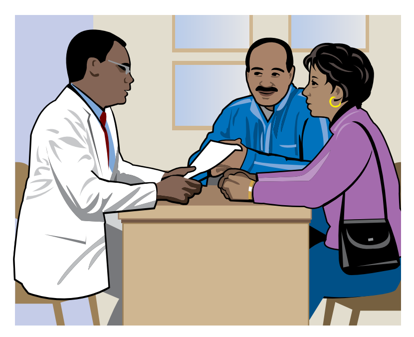
You and your doctor will develop a treatment plan.

The treatment that's right for you depends mainly on the type and stage of esophageal cancer. You'll probably receive more than one type of treatment. For example, radiation therapy and chemotherapy may be given before or after surgery.