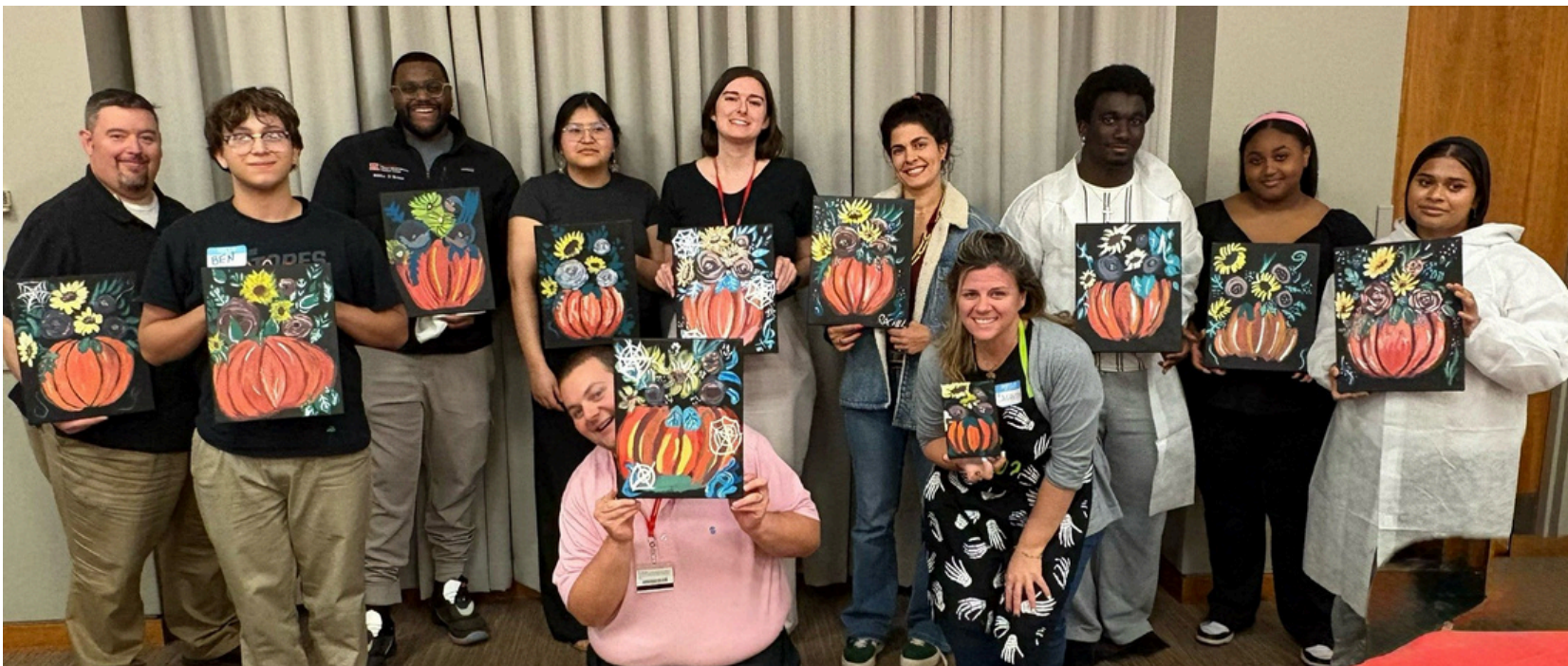
SEA, OPTIM, and RUYES scholars connected and unwound during a collaborative Paint and Pizza networking event, October 22, 2025.